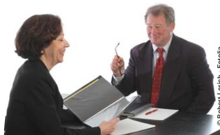
State 'advice' will not cover NPSS

However, if each adviser spends just three hours including preparation time with each