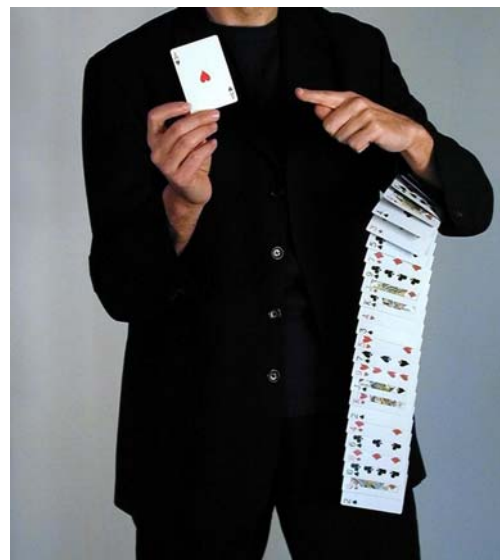
Chancellor uses sleight of hand, as usual

Enterprise Investment Schemes and Venture Capital Trusts also come in for some changes. Principally that the number of employees within investee companies has been limited to 50. A maximum of £2 million now applies to the amount of capital (from any relevant scheme) that can be raised within a 12 month period, by each investee company. He has also relaxed the time-frame for EIS managers to invest their cash from six to 12 months, which