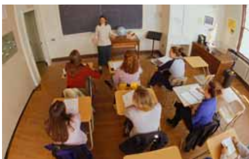
Students have enough to worry about without financial cares as well

If for example, £50,000 is invested by a grandparent in an offshore bond