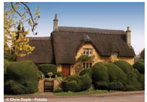
A strong housing market underpins confidence

Rising house prices are something of a mixed blessing. On the one hand, they lead to consumer confidence; on the other, they are potentially inflationary, by leading to demand for higher wages to cover bigger mortgages. From the viewpoint of young