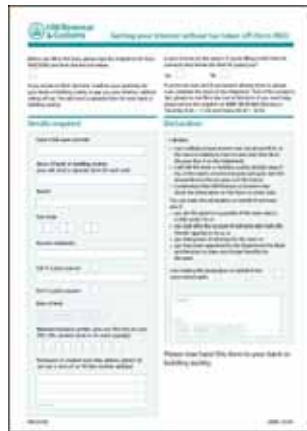
R85 allows interest to be paid gross

Of course, those not liable to tax can use form R85 to apply for gross payment of interest, but where money is invested by a parent on behalf of their child, it is actually treated as the parent's income for tax purposes as soon as the income exceeds £100 a year. For those with an eye to the longer term—particularly university education costs—having savings taxed is simply slowing the rate at which much-needed capital will grow.